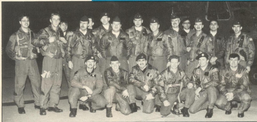
■ Above: Crews of the MH-53Js and HC-130Ns at Shannon after the rescue in the Atlantic. (USAFE).